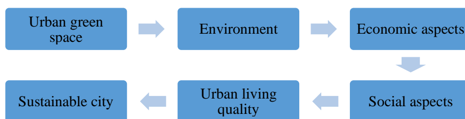
Figure 1. Model of sustainable city

In this section, we will analyze both main concepts, which represent the core of the research, namely green spaces and quality of life. Regarding green spaces, we can say that are a part of an open-space urban area, in which natural and mainly human-made forms are predominantly trees, shrubs, plants, flowers, grass, and others. They are maintained or built upon human supervision and management and are considered with relevant terms, rules, and expertise to improve citizens' living conditions, living environment, and welfare (Khansefid, 2013).